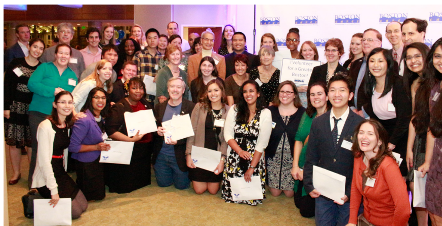
President's Volunteer Service Award Honorees