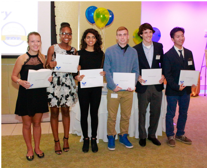
Members of Boston Cares' Teen Advisory Council

For a donation of $5,000 or more you may designate one of our award categories as “presented by” you, your company or foundation. These are available on a first-come basis.